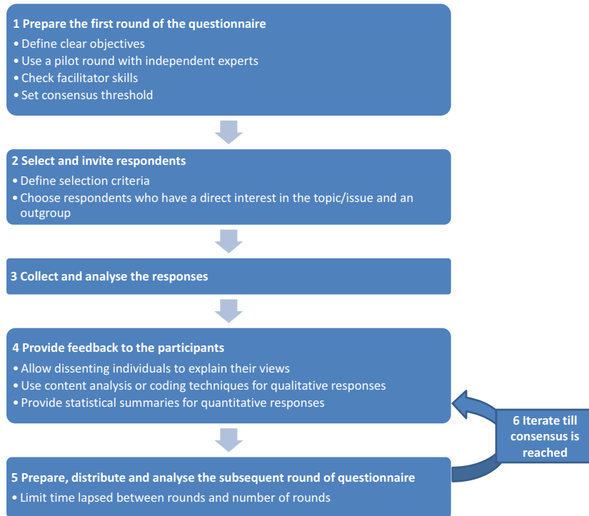
Fig. 1. Flowchart of the steps involved in the Delphi technique. Guidelines to avoid some of the common limitations of the technique are also highlighted (see section on guidelines).