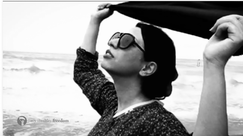
Figure 1 My Stealthy Freedom. Facebook post with photograph and text in Farsi, English, and French: “It is the second anniversary. . . .” May 9, 2016. A color version of this figure is available online.