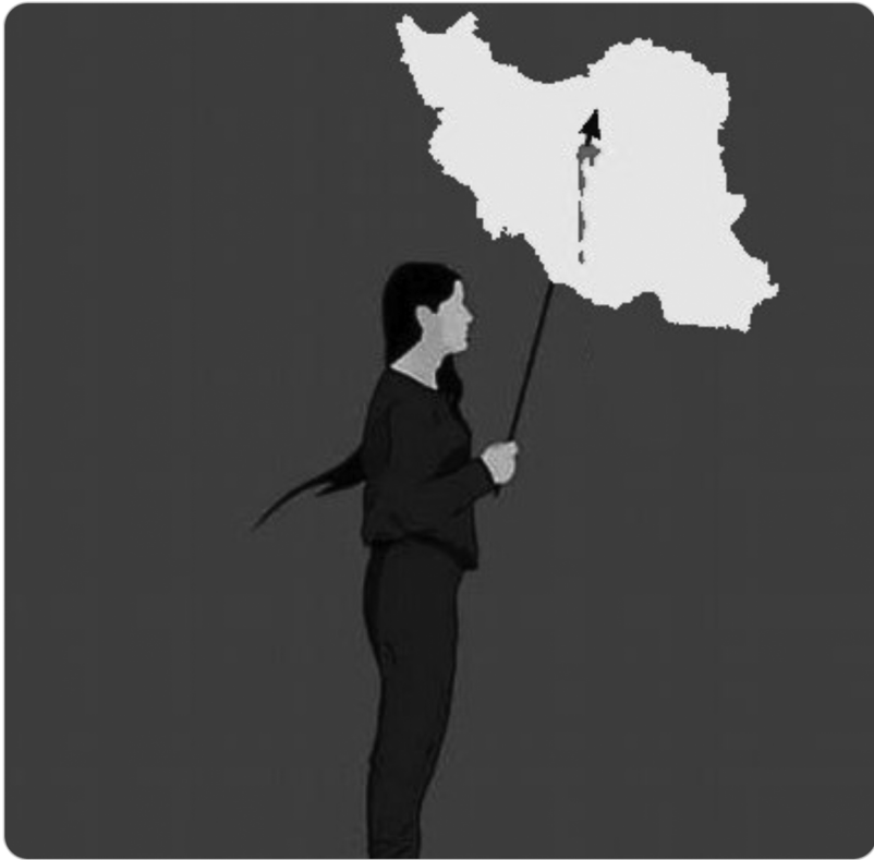
Figure 4 Anonymous. Image of Vida Movahed piercing Iranian territory with spear. Caption [in Farsi]: “The revolutionary girl in the Canadian parliament?” Circulated on various online platforms, December 11, 2018. A color version of this figure is available online.

Here the white of the scarf becomes the white of the homeland’s injured body. Again, the national audience and grounding of the Girls’ actions is implicitly admitted, but crucially, Movahed now stands outside (below) the nation’s boundaries. Previously, her body, with its scarf removed, embodied the oppression of one half of the nation; now, the scarf itself is reterritorialized as the body of the nation. The caption simply reads, in Farsi: “The revolutionary girl in the Canadian parliament?” Shaparak Shajarizadeh is now associated with Movahed, in such a way as to cast doubt on the authenticity of the Enghelab Street Girls’ performative resistance.