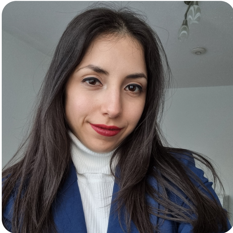
Yanki Yilmaz Innovation